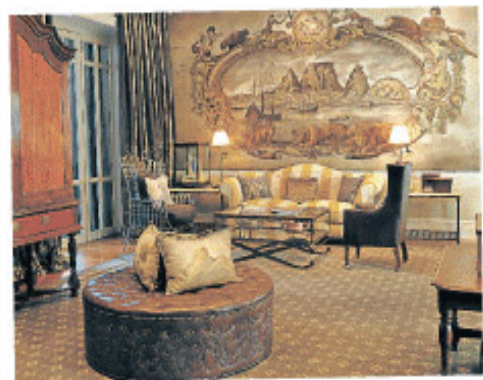
Chic retreat The fourth floor lobby

Rather than go down the minimalist route that many hotels feel they need to take when revamping today, Weixelbaumer has conjured up a walk-in story book, creating a warm, inviting and intriguing space that tells tales of Cape Town's maritime past but which also celebrates its position as a must-see destination.