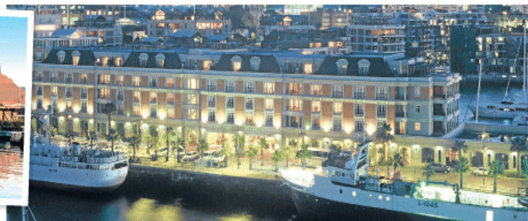
Location, location Top and right, the Cape Grace occupies an enviable position on Cape Town's Victoria & Alfred Waterfront